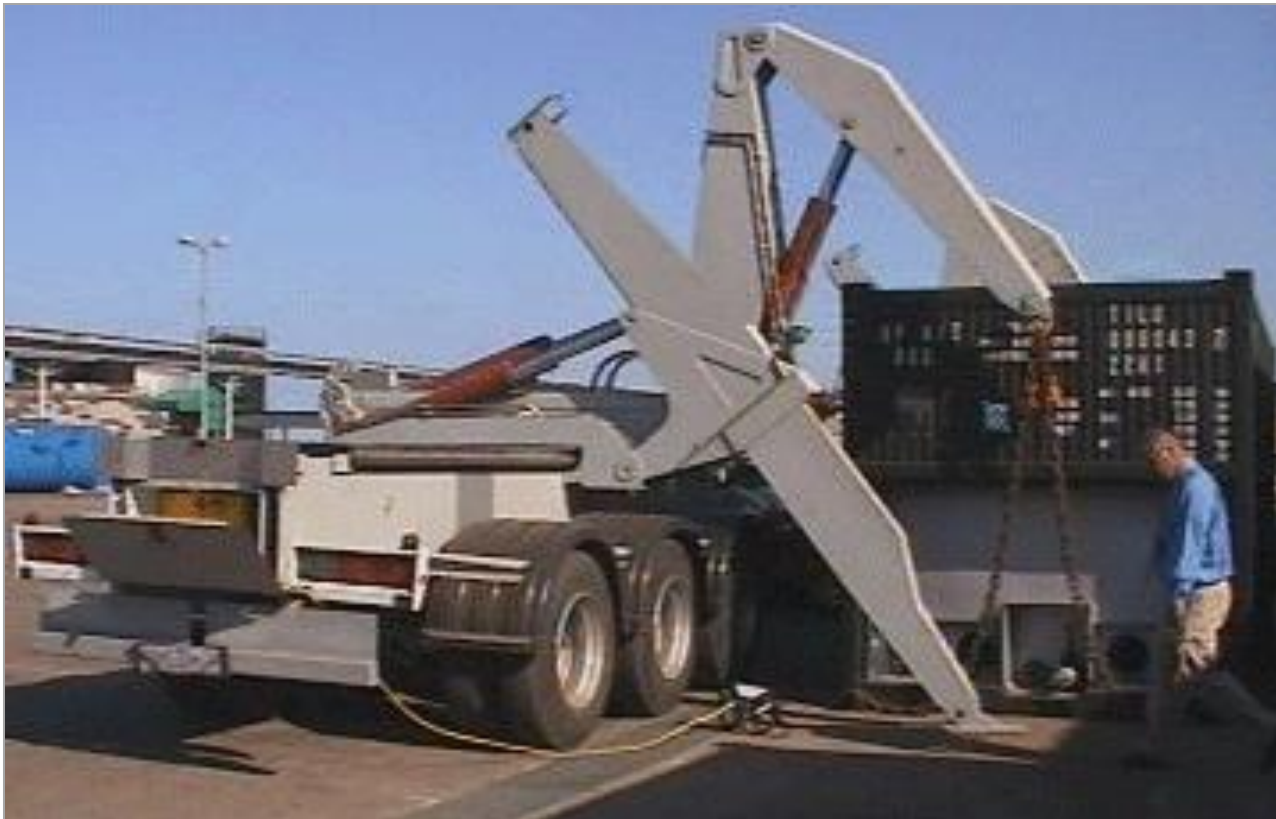
Container to Truck Handling