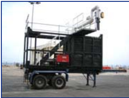
Moveable Ship To Shore Unit

TEC are about to undertake the final stages and commissioning of this project which will facilitate bulk delivery of Bitumen by Hot Ship to the quayside at Port Mesaieed through heated storage to truck loading for local distribution. Using versatile Bitutainers™ and innovative equipment such as their moveable Ship-to-Shore units, TEC have once again excelled at providing effective solutions for storage and transportation of Bitumen.