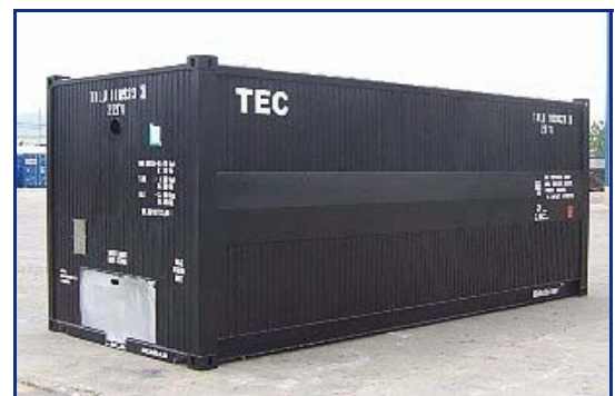
TEC Bitutainer™ IMO1 Model TRT-T-678 has a 24Mt carrying capacity. It is fully IMDG compliant with ADR/RID, US DOT