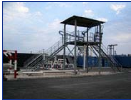
Truck Loading Gantry Installed