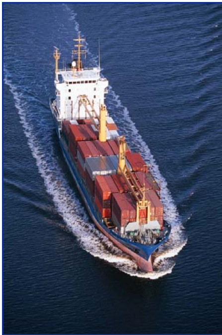
Today's modern container ships circumnavigate the globe transporting bitumen to Barbie Dolls...