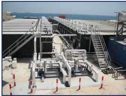
Facility Ready for Commissioning

Company Focus.... TEC's core areas of business are supplying innovative solutions for the handling, storage and transportation of bitumen, fuel oils and lubricants based around the Bitutainer™ range of tank containers.