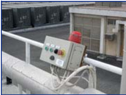
High Level Safety Controls